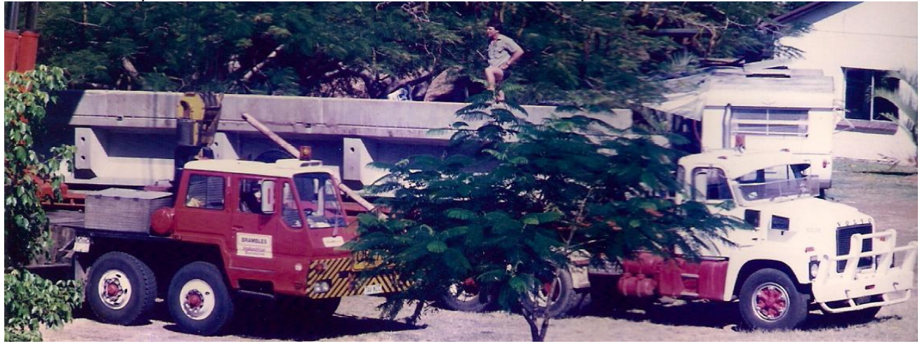
Transport and Cranes donated for use

The previous and current club never always had money accessible. Some years were run on pure donations, and some members paying years in advance for membership so that bills could be paid and activities could be covered. A non profit club runs on a fine line.