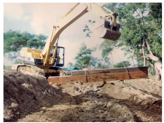
Machines and materials donated – Lots of Foremen