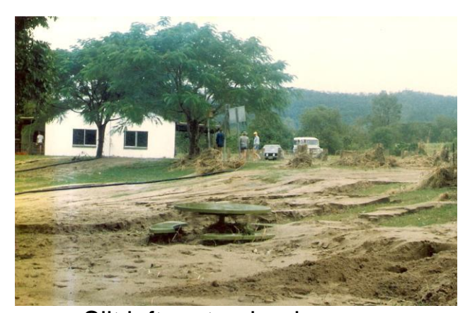
Silt left on top bank

Floods have changed the bank several times and will continue to do so. The club has been fortunate, as it has been many years since that sort of water has come down the river and left such damage. During the 1980's flood waters regularly ran through the clubhouse, usually just high enough to go up over the toilet bowl height. Sometimes 3 times a year. At other times up to the concrete block at the top of the building. Once seen by John Newman only 2 foot of the apex of the roof was showing. Or course it was hard to get there to see as everywhere else, including the roads to the Ski Club were flooded. The owners that live along Newman's Road and in that area have seen and told some great stories about the river in flood. One story Keith and Val Pearce often tell is about the time it was that high, that their caravan was stuck in one of the trees. Mr John Newman went down and lassoed it out of the tree while still afloat and towed it to high ground.