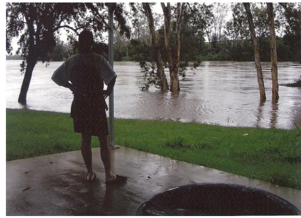
The river rising......