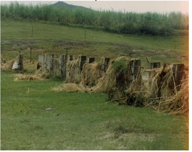
Debris caught on sleepers