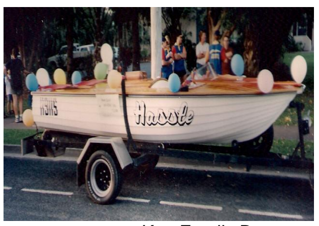
Pearce Family Boat