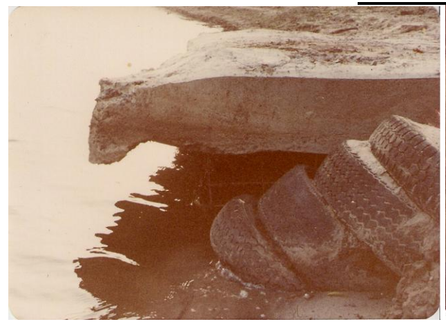
The Old boat ramp(front of clubhouse)