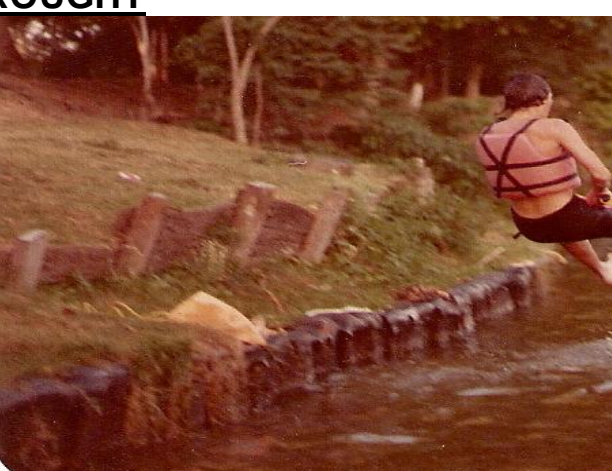
Part of original bank construction