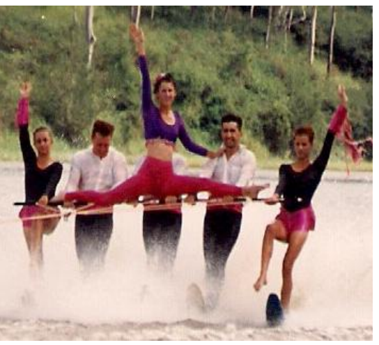
The Street Parade was always a lot of fun, boats, cars, lollies, water pistols, and kids would ride skates or roller blades behind the boat while hanging onto a rope.