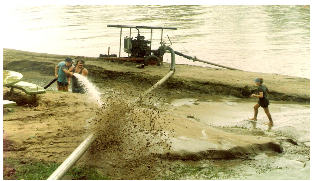
A pump borrowed from local farmer to wash away deep silt left by a flood.

When the tank was set up and water was hooked up to the club, the first pump on the waters' edge was a petrol driven pump. Someone always had to remember to take fuel and start it. The floods drowned each pump several times, and took a couple away. Theories of how to build a cover over the pump that would hold a bubble of air around it to stop it getting wet bought out some Einstein Theories... Solution – submersible pump!