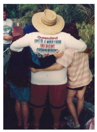
This isn't the end, this is only the beginning.....