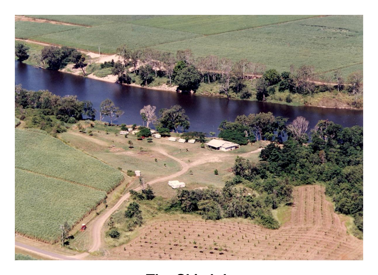
The Ski club (photo taken from the tiger moth after1988)