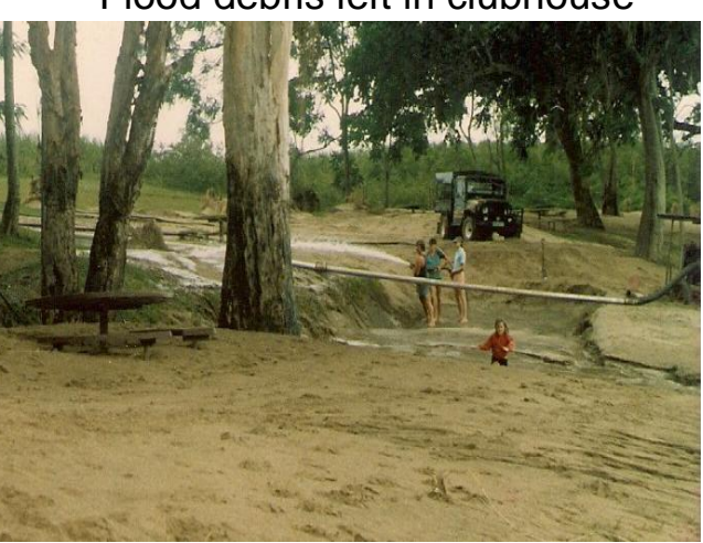
Depth of Silt